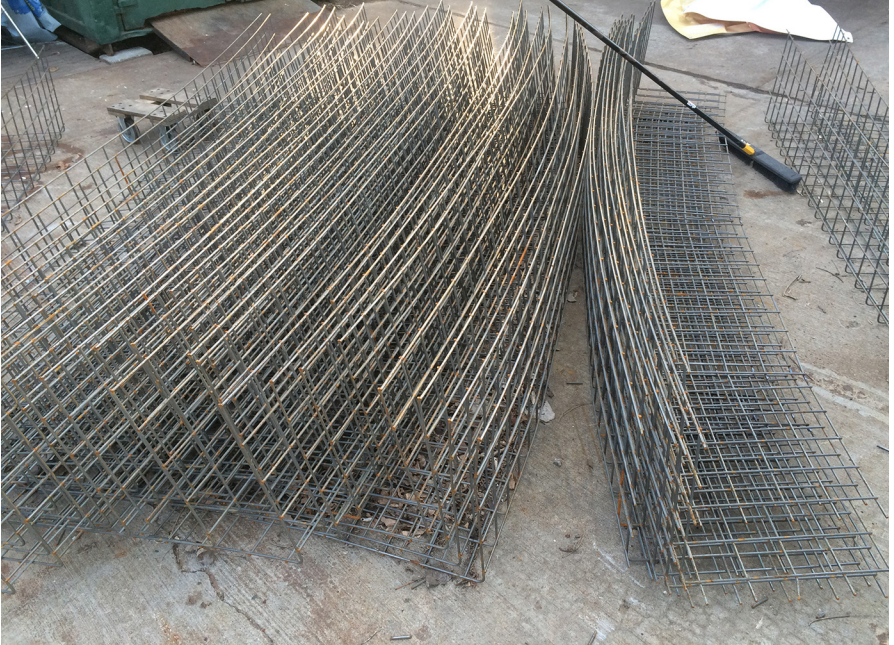
Above: Detail of Half Moon by Abigail DeVille