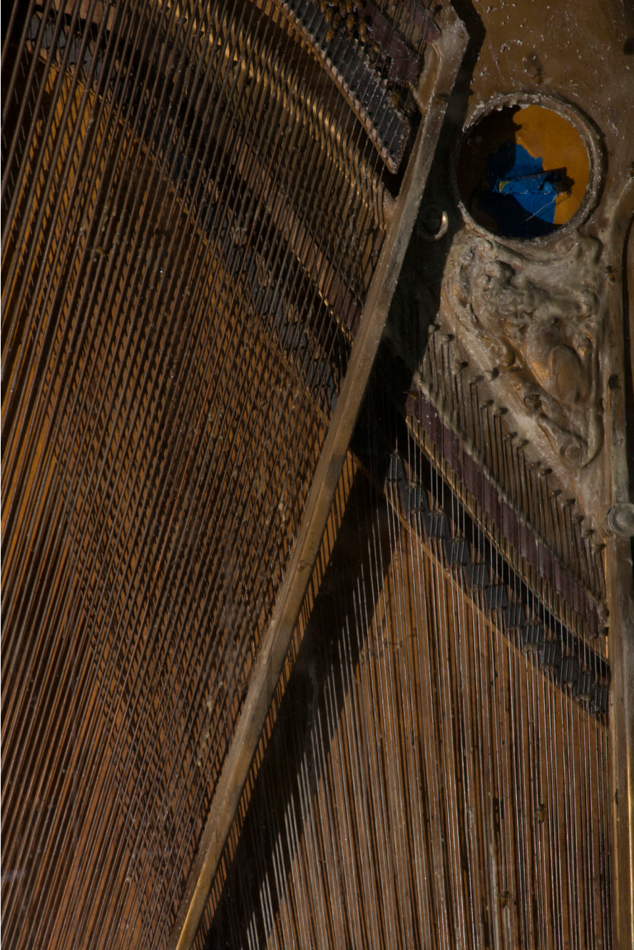
Detail of Fugue in B flat